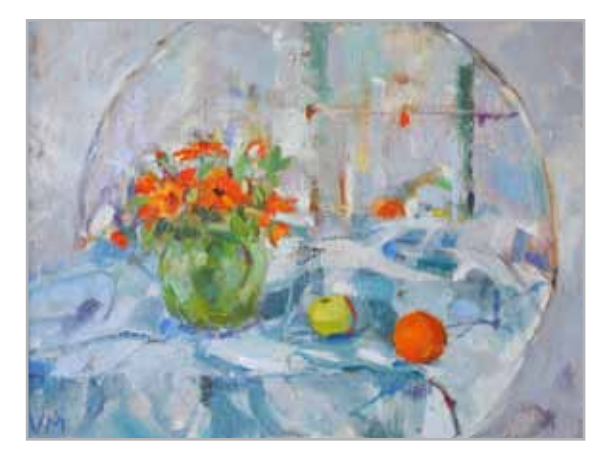
Calendulas 12" x 16"