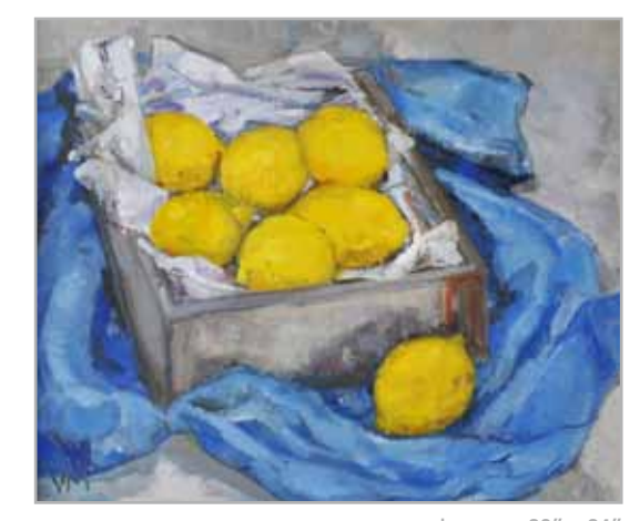
Still life in sunshine 12" x 16"