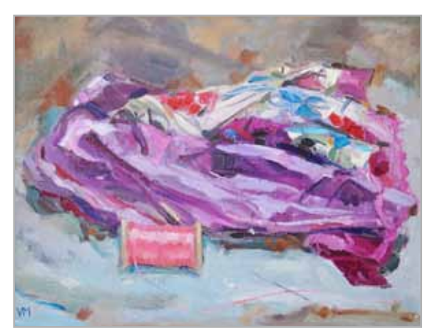
Threads 14" x 18"