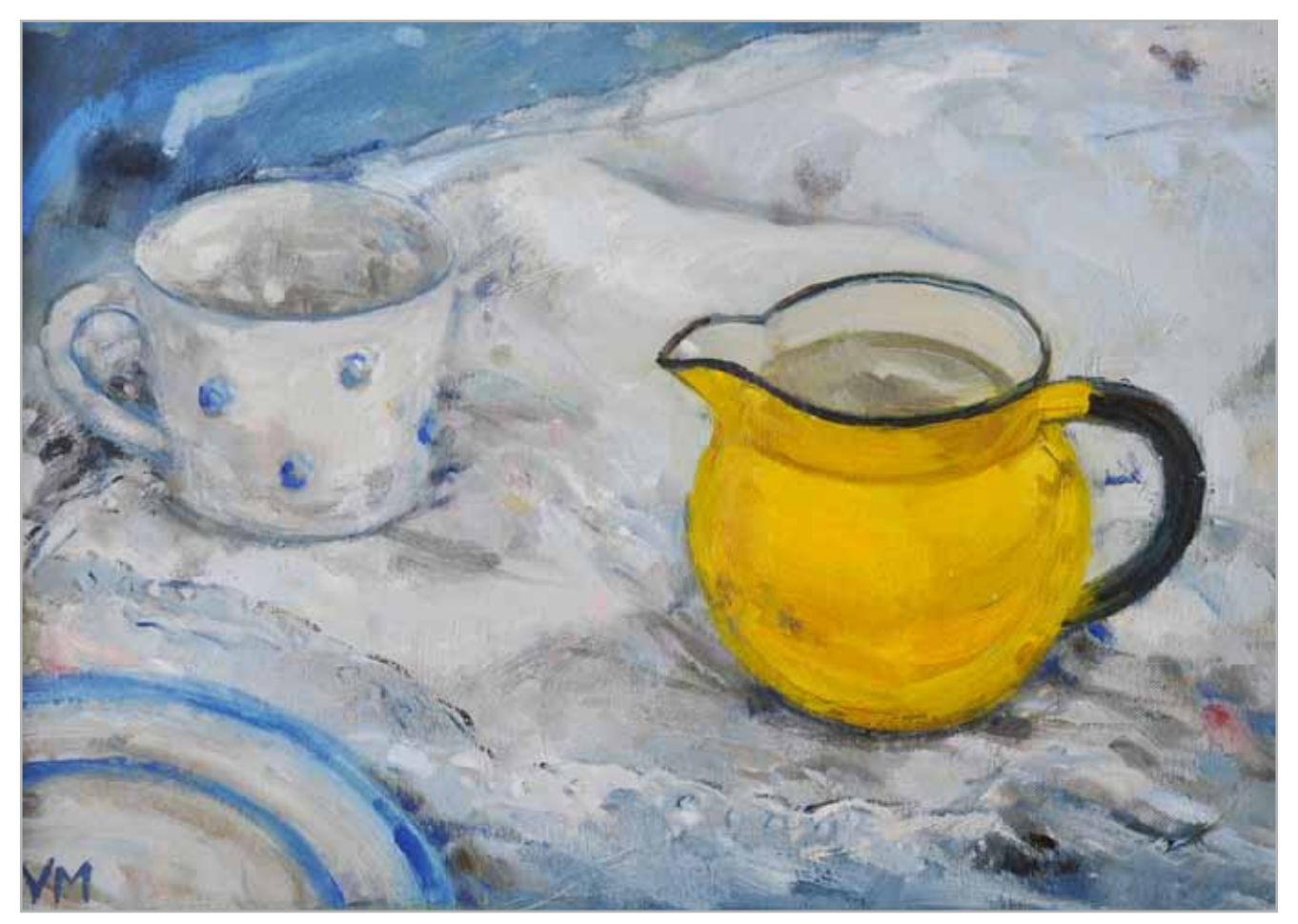
Yellow jug with spotted cup 16" x 22"