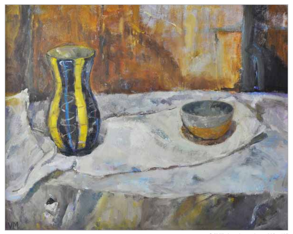
Still life in ochre colours 32" \times 40"