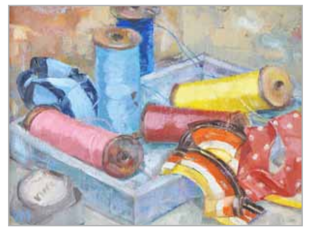
Ribbon spools 12" x 16"