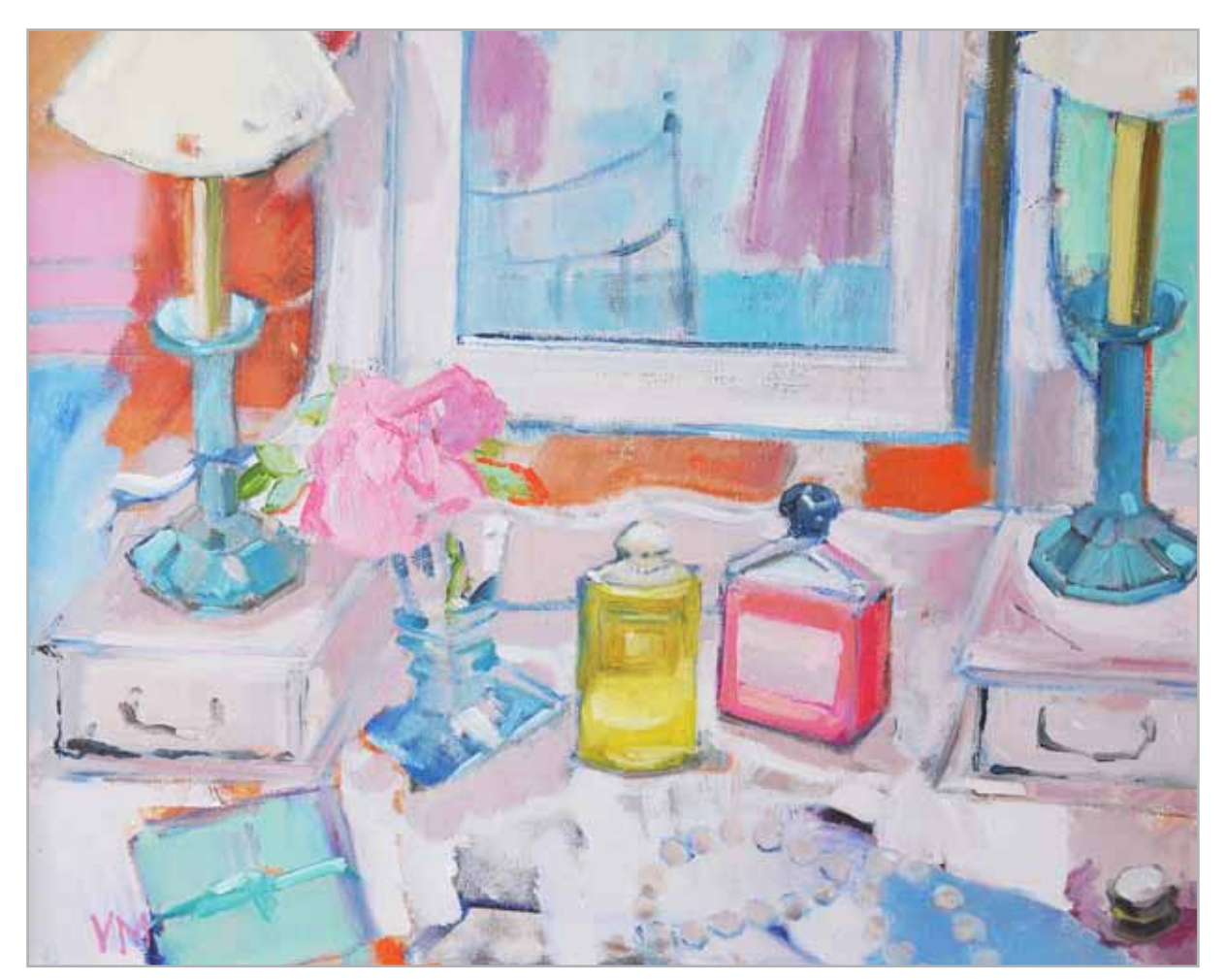
Powder and pearls 24" x 30"