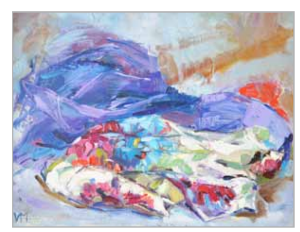
Pure silk 12" x 16"