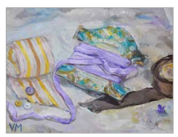
French haberdashery 12" x 16"